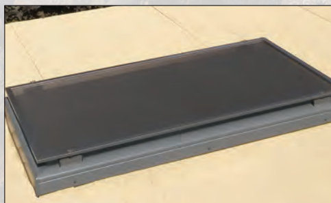
FL Model Sky Shade - Low profile for shading "flat" skylights.