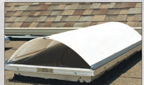
KD Model Sky Shade - Built for shipping long distance; easy to assemble and install.